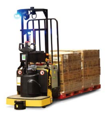
Reduce labor costs by automating pallet transfers up to 8,000 pounds with the Yale Robotic End Rider.

Rising wages, high employee turnover and damaged equipment consume a massive part of a warehouse's operational budget. In times of recovery and uncertain outlook, businesses need to start developing an automation strategy to reduce costs, increase efficiency and remain competitive.